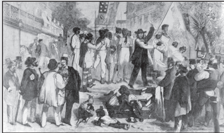
A slave auction.

Their lives a streamlet blent in one— Oh, Father! must they part? They tear him from her circling arms, Her last and fond embrace. Oh! never more may her sad eyes Gaze on his mournful face. No marvel, then, these bitter shrieks Disturb the listening air; She is a mother, and her heart Is breaking in despair.