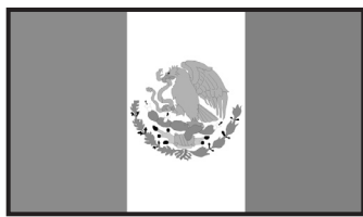
verde blanco rojo

Caught'ya! Grammar with a Giggle for Third Grade