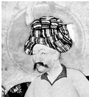
'Abbās I, detail of a painting by the Mughal school of Jahāngir, c. 1620; in the Freer Gallery of Art, Washington, D.C.

'Abbās I known as 'Abbās the Great (b. Jan. 27, 1571—d. Jan. 19, 1629) Shah of Persia (1587–1629). Succeeding his father, Muḥammad Shah, he strengthened the ŠAFĀVID DYNASTY by expelling Ottoman and Uzbek troops and creating a standing army. 'Abbās made EŠFAHAN Persia's capital, and under him it became one of the world's most beautiful cities. Persian artistic achievement reached a high point during his reign; illuminated manuscripts, ceramics, and painting all flourished, and the Portuguese, Dutch, and English competed for trade relations with Persia. Tolerant in public life (he granted privileges to Christian groups) and concerned for his people's welfare, his fear for his personal security led him to act ruthlessly against his immediate family.