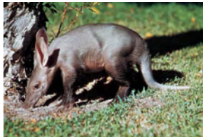
Aardvark ( Orycteropus afer ).

aardvark or African ant bear Heavily built mammal ( Orycteropus afer ) of sub-Saharan forests and plains. Its stout, piglike body ("aardvark" is Afrikaans for "earth pig") may be as long as 6 ft (1.8 m), including a 2-ft (60-cm) tail. It has a long snout, rabbitlike ears, short legs, and long toes with large, flattened claws. It feeds at night by ripping open ant and termite nests and lapping up the insects with a long (1-ft, or 30-cm), sticky tongue. Though not aggressive, it uses claws to fight off attackers. Its classification with regard to other mammals is uncertain.