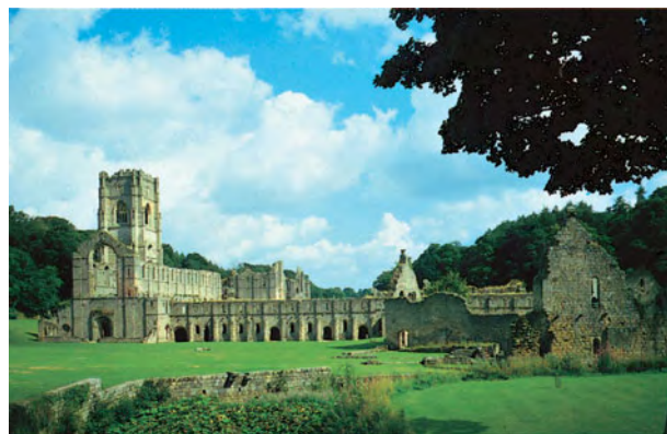
The ruins of Fountains Abbey, a Cistercian monastery founded in the 12th century, near Ripon, North Yorkshire, England

abbey Complex of buildings housing a MONASTERY or convent under the direction of an abbot or abbess, serving the needs of a self-contained religious community. The first abbey was MONTE CASSINO in Italy, founded in 529 by St. BENEDICT OF NURSIA. The CLOISTER linked the most important elements of an abbey together. The dormitory was often built over the dining hall on the eastern side of the cloister and linked to the central church. The western side of the cloister provided for public dealings, with the gatehouse controlling the only opening to the outer, public courtyard. On the southern side of the cloister were a central kitchen, brewery, and workshops. The novitiate and infirmary were housed in a building with its own chapel, bathhouse, dining hall, kitchen, and garden. In the 12th–13th century, many abbeys were built throughout Europe, especially in France.