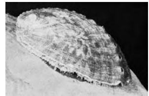
Abalone ( Haliotis )

abalone \ä-bə-'lō-nē\ Any of several marine SNAIL species (genus Haliotis , family Haliotidae), found in warm seas worldwide. The outer surface of the single shell has a row of small holes, most of which fill in as the animal grows; some remain open as outlets for waste products. Abalones range from 4 to 10 in. (10–25 cm) across and up to 3 in. (8 cm) deep. The largest is the 12 in. (30 cm) abalone ( H. rufescens ). The shell's lustrous, iridescent interior is used in ornaments, and the large muscular foot is eaten as a delicacy. Commercial abalone fisheries exist in California, Mexico, Japan, and South Africa.